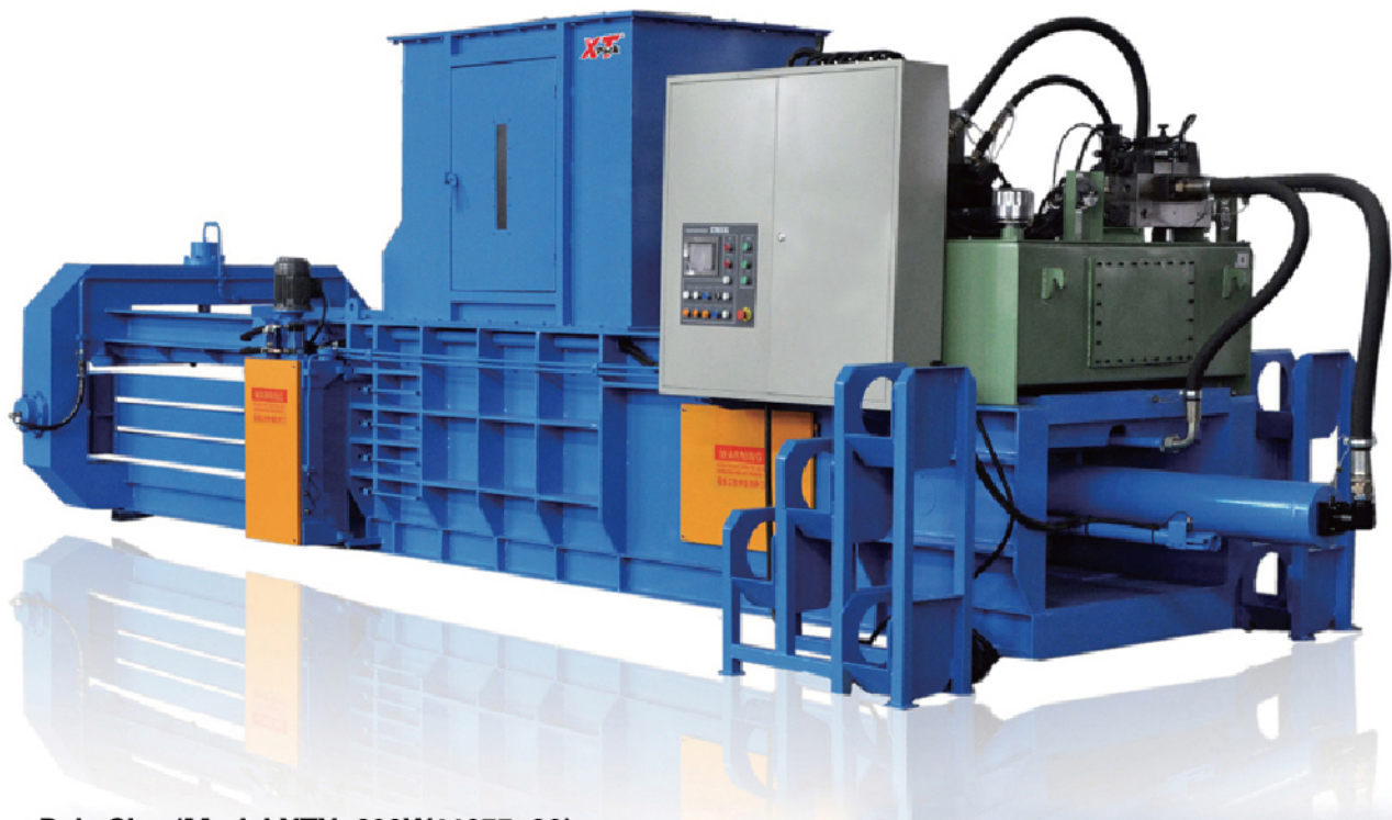
Bale Size (Model XTY-600W11075-30)

Widely used for compressing waste cardboards, cartons, paper, plastic film, straw etc.